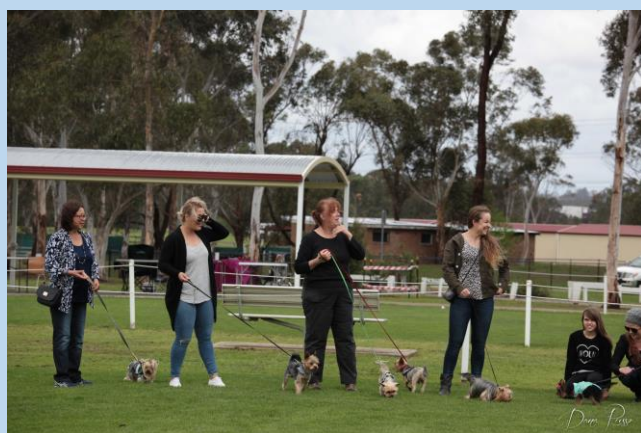
2018 Yorkie Picnic

We will also hold our second Yorkie Family Picnic and fun show on Sunday 13 October, where your yorkie (or yorkie imposter!!) can show off tricks and challenges to earn prizes.