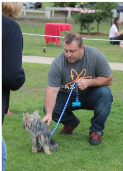
More 2018 Yorkie Picnic fun