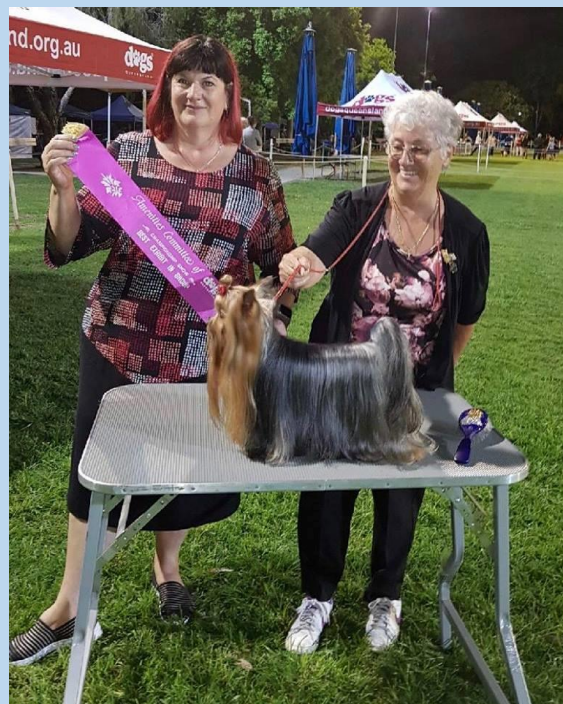
Grand Ch Karojenbe Shaken Not Stirred

I do think that some of our top winning Yorkies could compete against overseas Yorkies, we just need more of them!! Yorkshire Terriers are a very difficult breed to get everything right in one little package, not only do we need good conformation, we also need correct coat colour and texture and to top it off - we want that outgoing personality. I believe we need to encourage more exhibitors. I know Yorkies are a difficult breed to maintain with grooming, but the rewards are so wonderful when you see a Yorkie in full coat gliding around the ring.