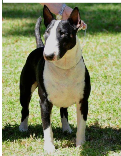
Ch. Kahmins Harvest Moon (ROM)