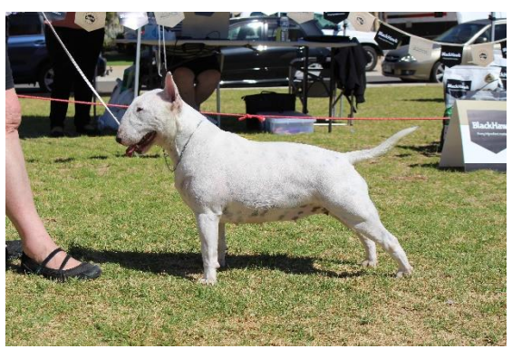
Kahmins Chasing Faith (ROM)