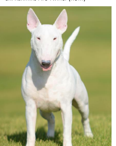
Ch. Kahmins Fire Twirler (ROM)