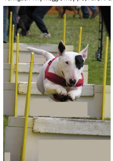
Faringdon Tiny Maggie May (FD, FDX, AFCH