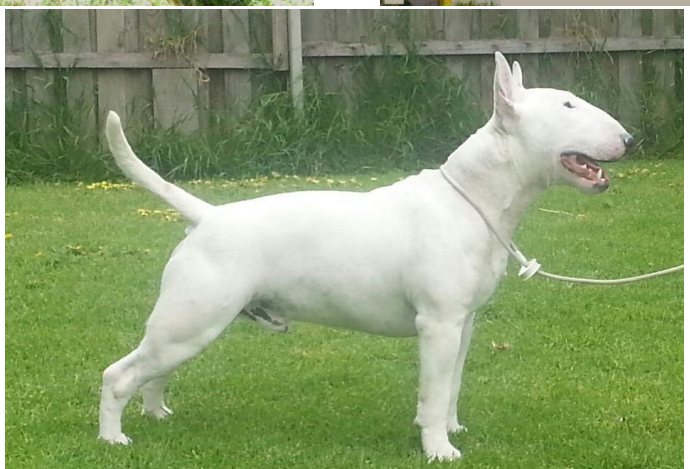
Kahmins Oriental Moon