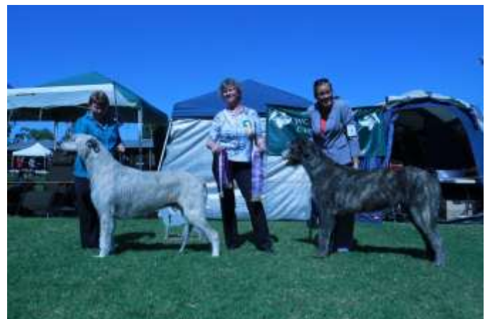
Star & Teekay