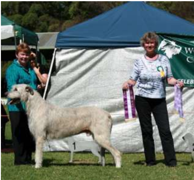
Champion Dog "Starman"