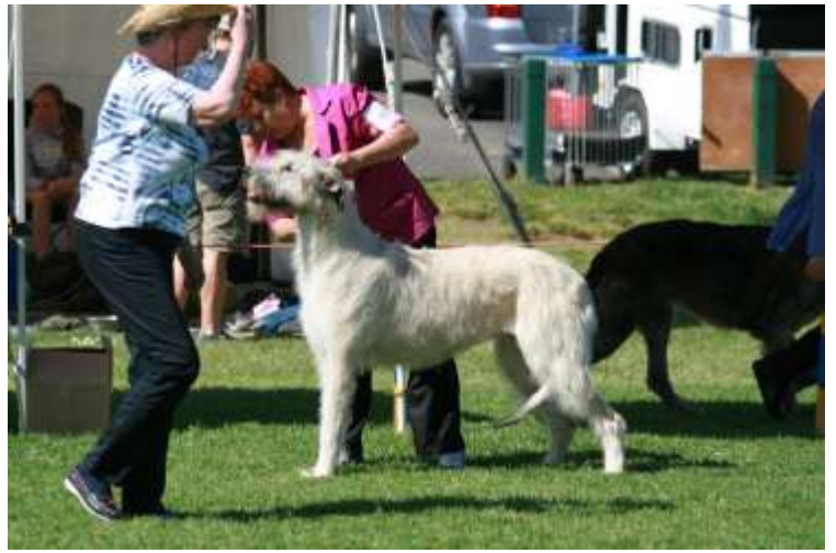
Champion Bitch "Finola"