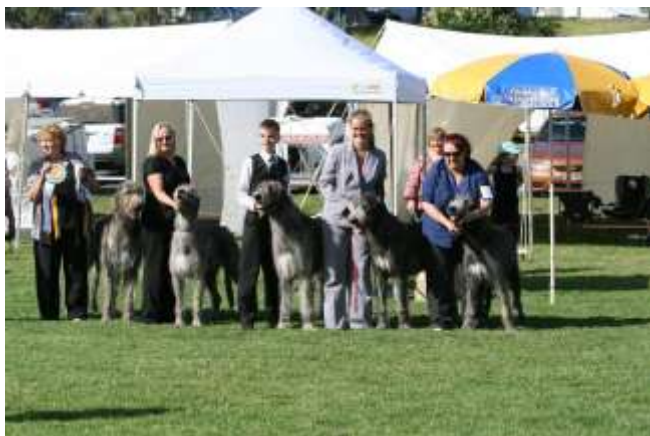
Roni x Kodi offspring