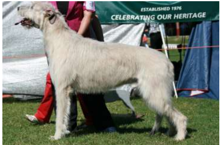
Best In Show "Finola"