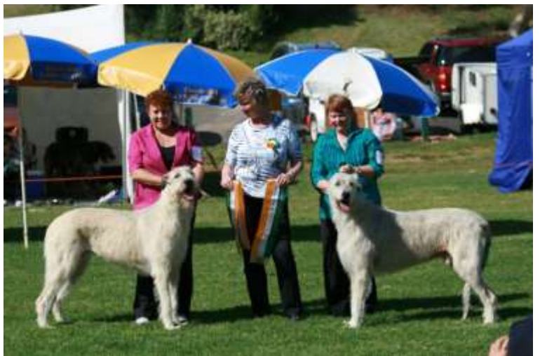
"Finola " & "Starman"