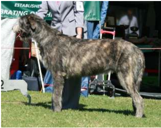
Best Puppy Teekay