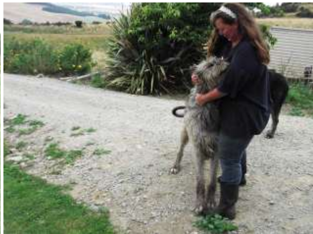
Dathi & Blaik's rear end