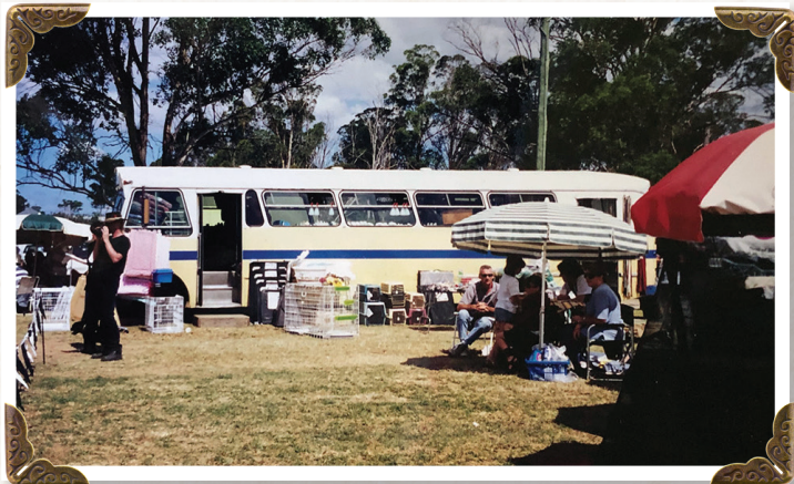
The "Showaquipment" 2nd Bus