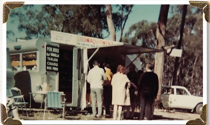
The "Showaquipment" Caravan