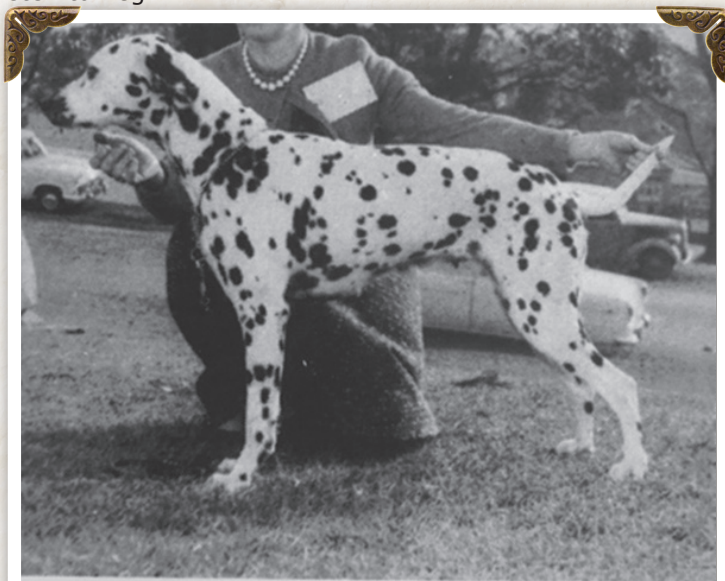
CH. DUBROVNIK MESCAL s. Kerford Kyle (imp UK) d. Ch. Dubrovnik Salona