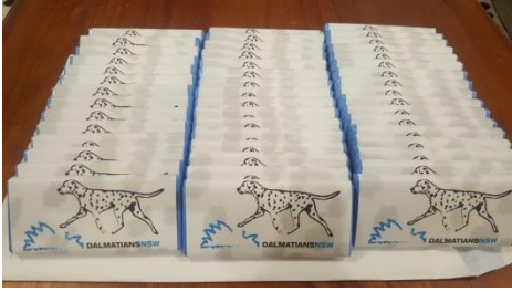
Our $1 Dalmatians NSW Chocolates