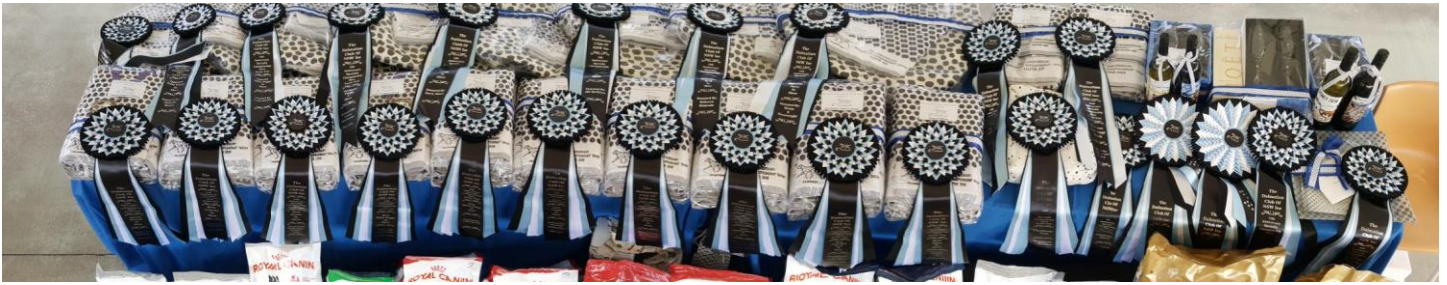
Our stunning rosettes created by Marellen Show Ribbons