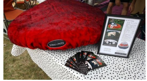
Pods 4 Pets Raffle