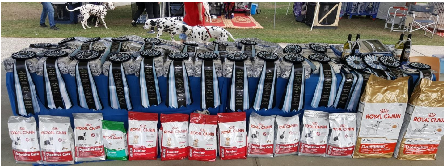
Thank you to our major food sponsor for 2018 – Royal Canin