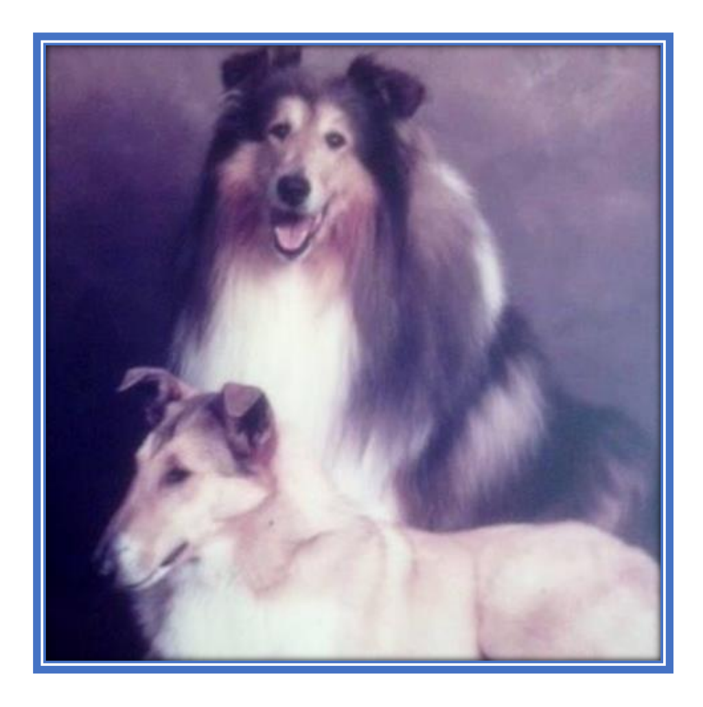
Ch Wayrod Kinda Handsome with Moorholme Neatn Trim