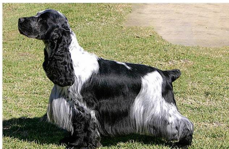
English Cocker Spaniel