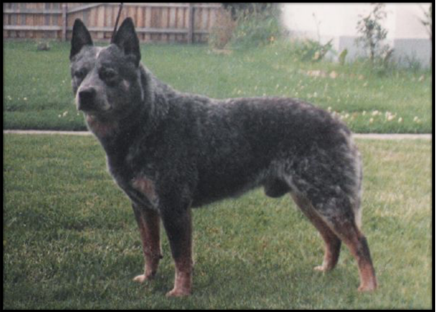
CH Pureheel Royal Tyson Owned by A & R Spargo Best Exhibit in Show February 1994