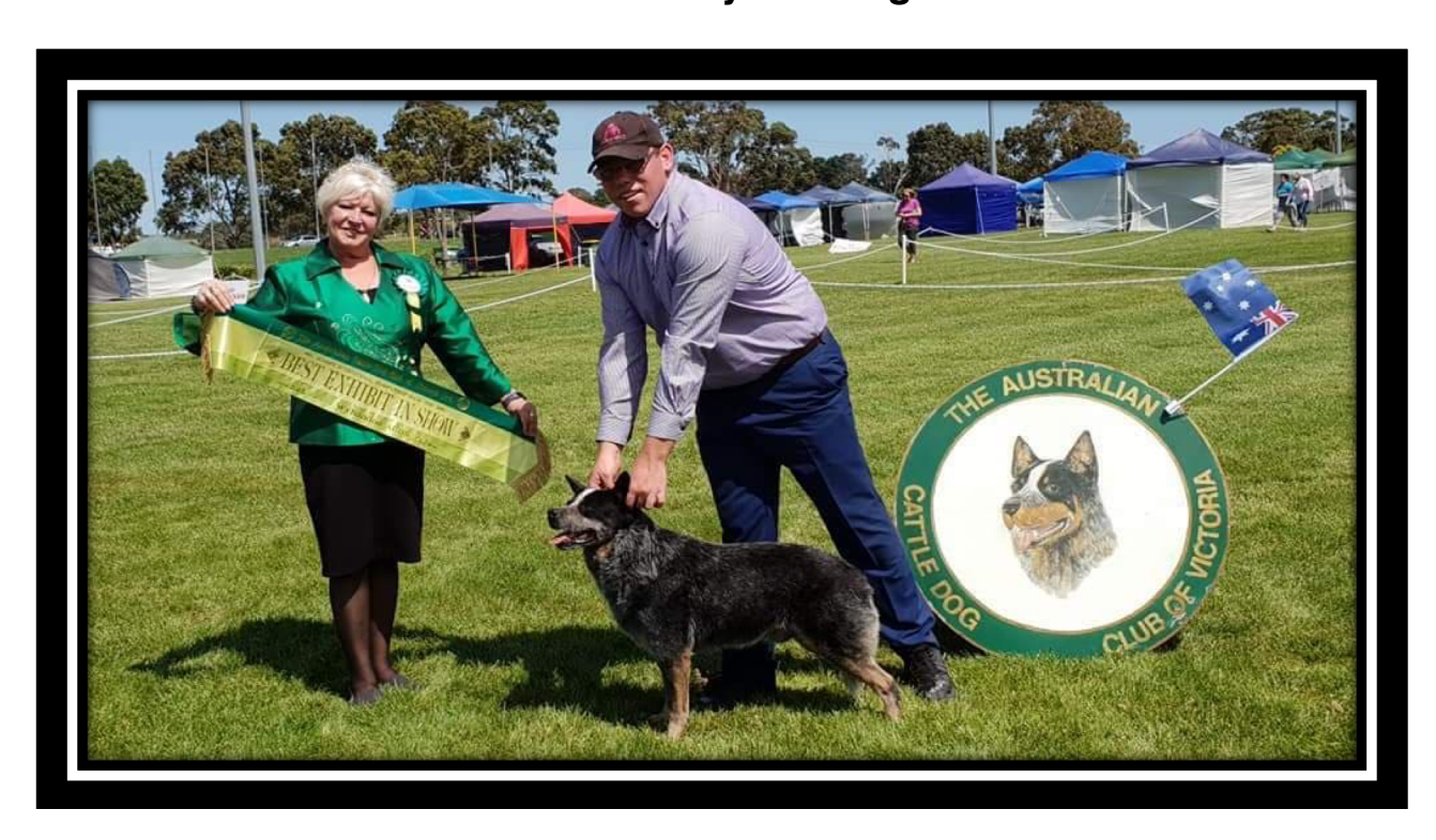
Summer International Championship Show December 2018 Best in Show Supreme Ch Melcathra King of the Mountain