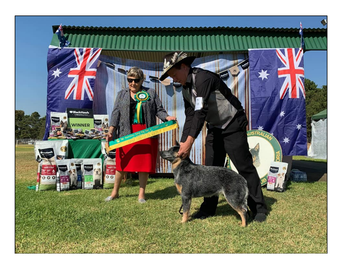
Speciality Show April 2019 Best in Show Pureheel Royal Starlight