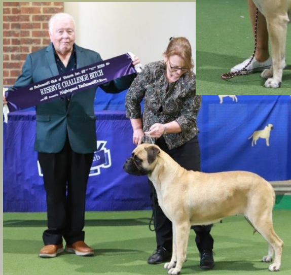
right—Res Dog—C.I.B. A20, Sup Ch Mymooch Judges Quest left Res Bitch—Ch Nightquest Youngstar