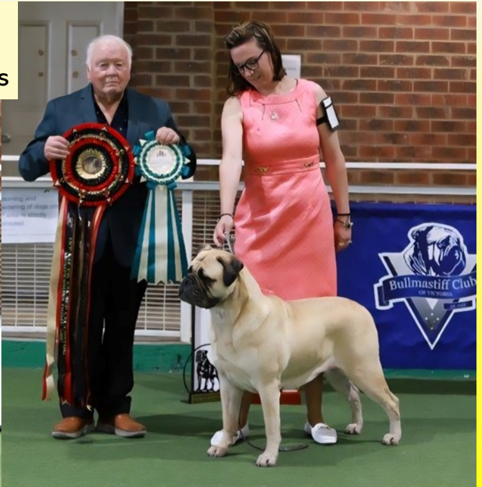
top left—RUBIS Ch Sweetbryar I Got The Music Inme top right—BIS C.I.B. A20, Sup Ch Gameguard Innuendo. left—Best Baby—Nightquest Twenty Four Seven