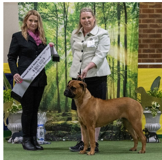
Best Red—Ch Nightquest In Her Time (above) Best Parent & Progeny—Sup Ch Mymooch Judges Quest (below)