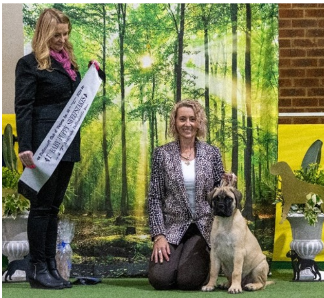
1st Baby Puppy Sweepstakes—Lorenzabull Kiss My Ace (above) 1st Puppy Sweepstakes—Bullnarli Ultimate Pick Up