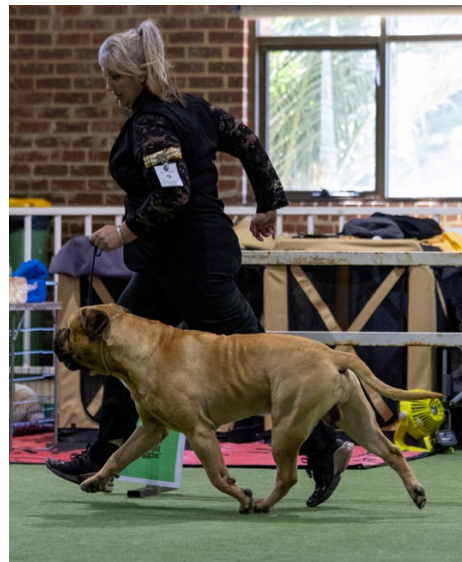
Best Movement —Bullgladiata Tennessee Whisky (above) Best Fawn—Ch Anmenta Instant Celebrity Best Brindle—Banobrae Kitty Bennett