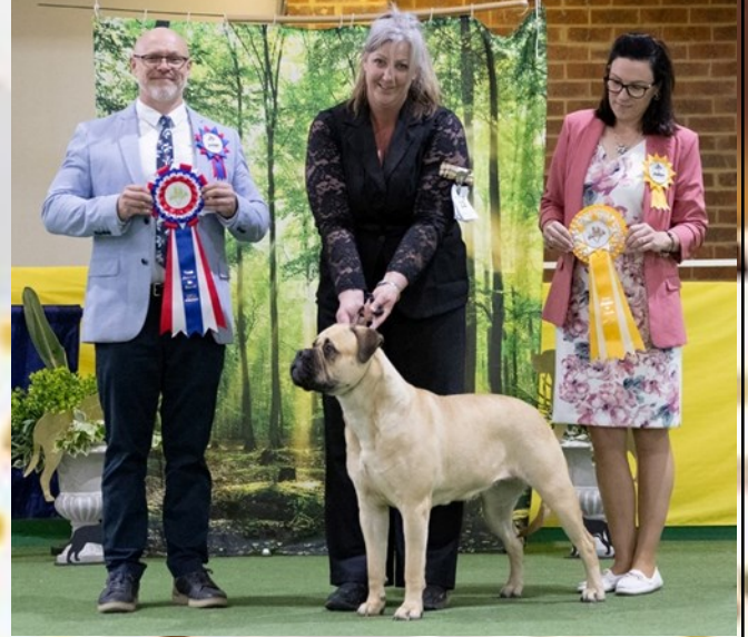
clockwise from top left—Baby Puppy in Show both shows. Minor Puppy in Show both shows, Junior in Show both shows, Dog Challenge and Open in Show both shows. Reserve Challenge Dog 51st Show, Reserve Challenge Dog 50th Show.