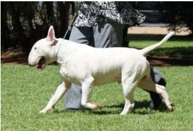
JACAMAR DREAM TIME Best in Show BTCV Specialty Show April 2013 Owned by – A Sutcliffe