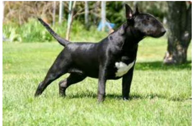
HULIA BIG BLACK JACK Best In Show BTCV Championship Show April 2013 Owned by – V Frith