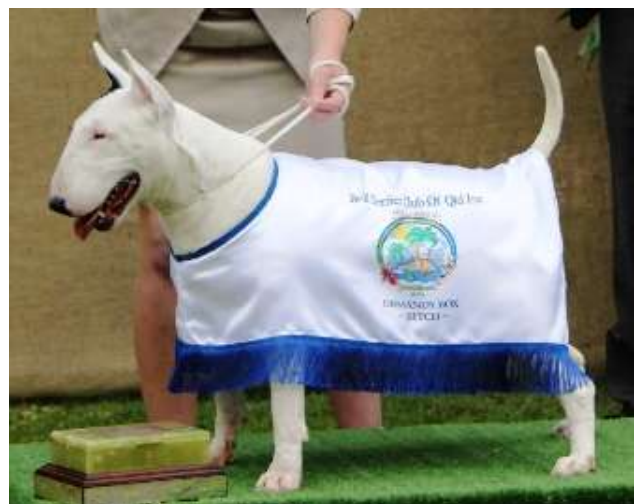
BULLROY BLINGITY BLING Runner Up Best in Show BTCV Championship Show April 2013 Owned by – S & S Humphrey (Photo taken at the recent Trophy Show)