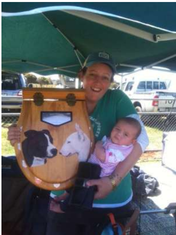
Our club's secretary holding the dunny seat trophy and one half of her twins (the pink one)