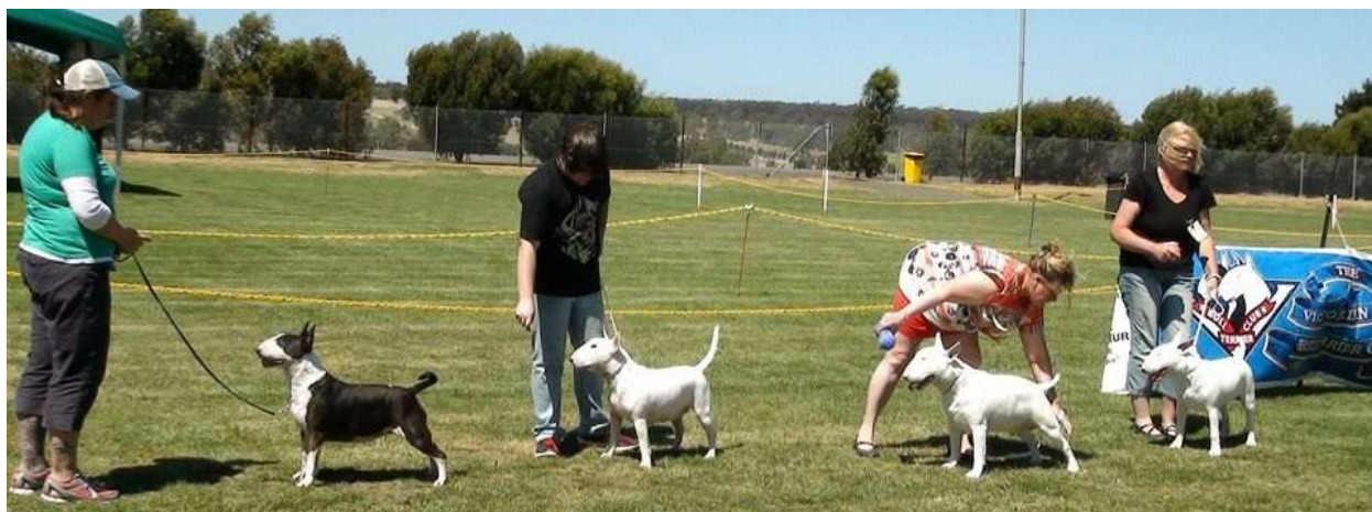
These were the winning Bullies, from L-R- Bonari Celtic Rose ROM, Wakatang American Dream, Bullpatchy River Man ROM, Wakatang Sweet Revenge