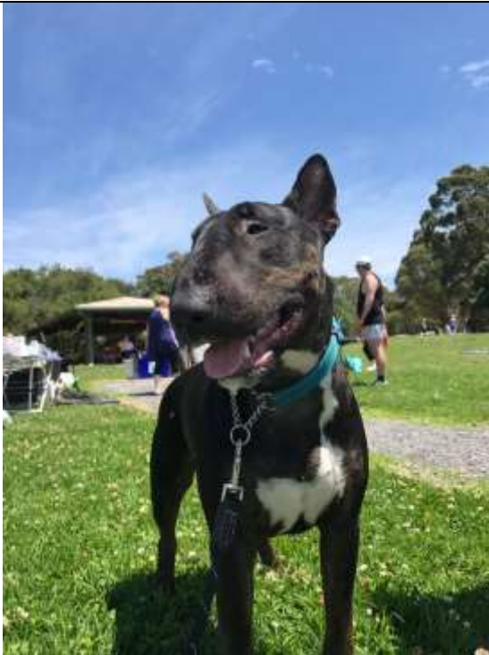
Onslow says, "I'm ready for anything"