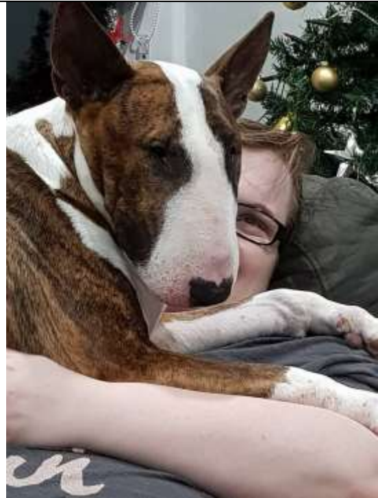
I can get closer!