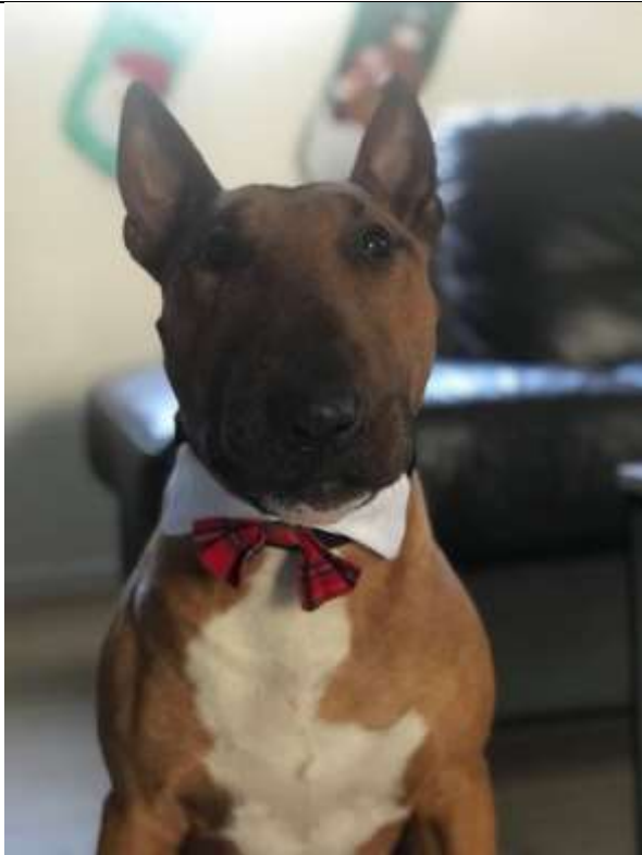
Thunder is all dressed up with nowhere to go