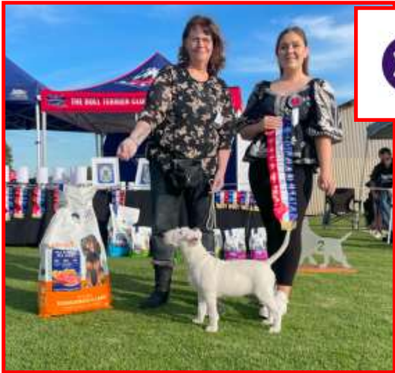
Best Baby Puppy