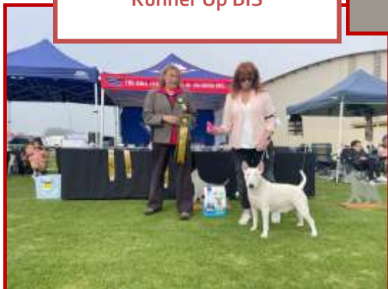
Runner Up BIS