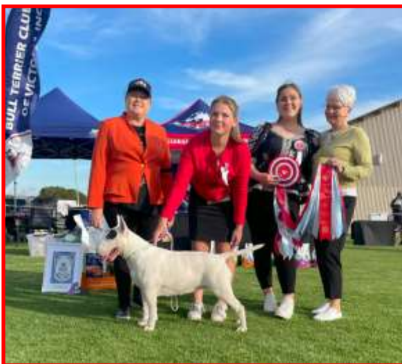
Best In Show / Challenge Bitch / Best Aus Bred