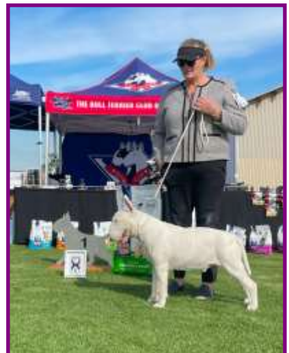
Baby Puppy in Show