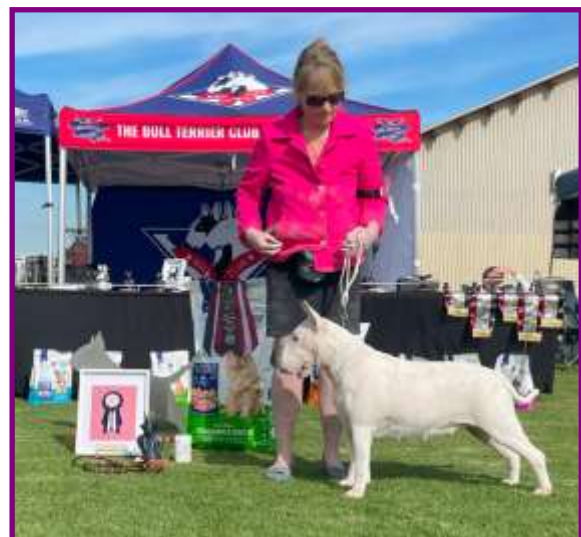
Runner Up Best In Show