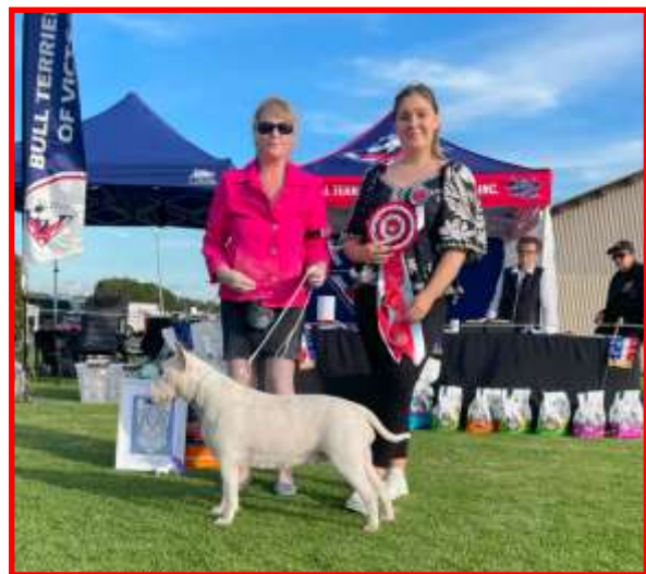
RU Best In Show / RU Ch Bitch / Best Intermediate