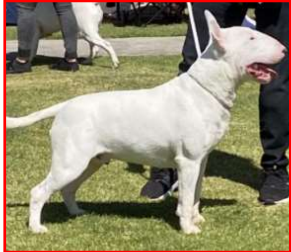
Challenge Dog / Opp Intermediate