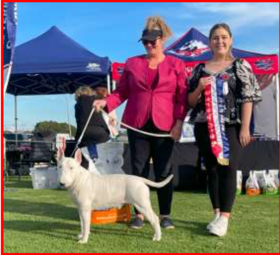
Reserve Challenge Dog / Best Open