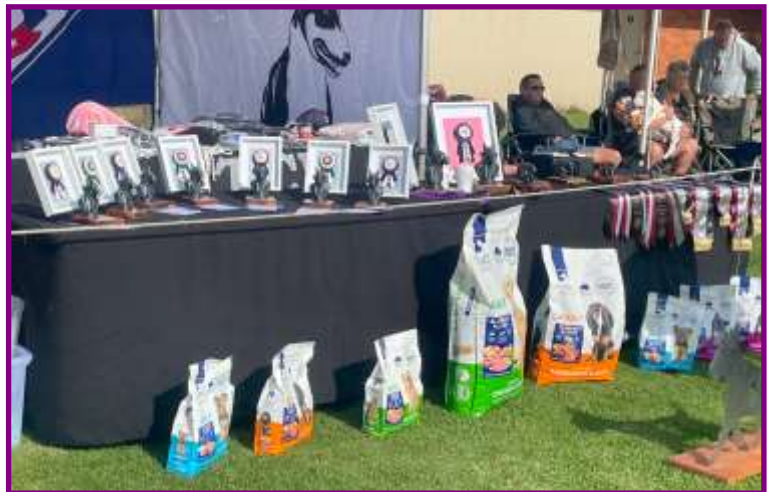
Challenge Dog Junior in Show