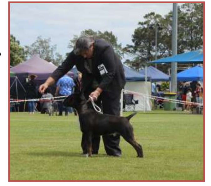
Best Open - Potens Dread Fort