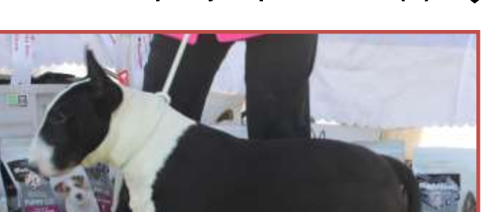
Best Minor—Bullpatchy Souperlative River (AI)