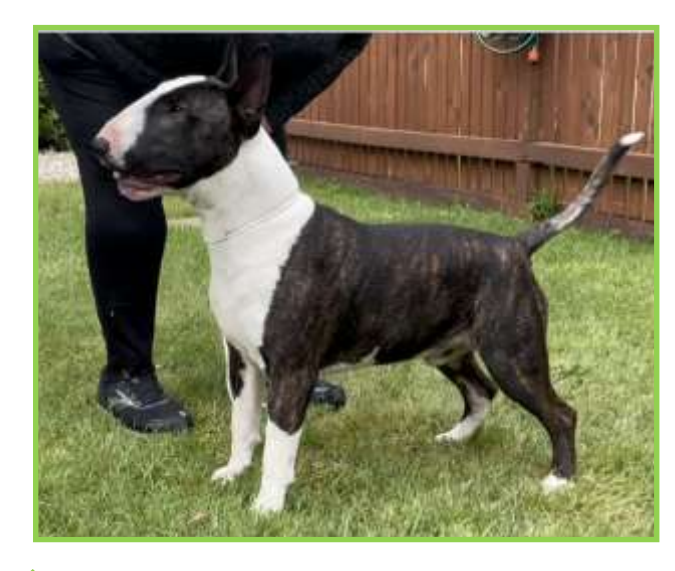
Best In Show/Best Dog/Best Junior -Braxstar Dirty Livin (AI)