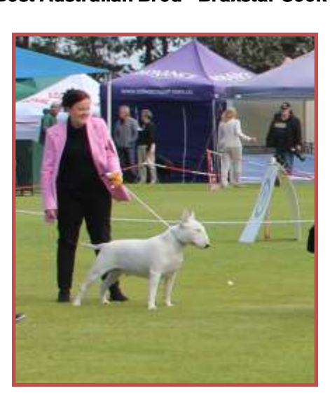
Best Australian Bred - Braxstar Seek and Destroy (AI)