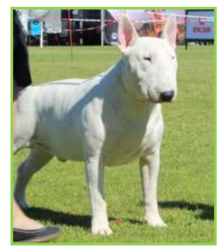
RUBIS/RU Dog/Best Intermediate CH Kaha High Roller (AI)