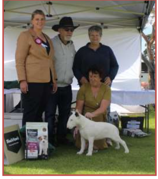
Best Baby Puppy - Balgay Lets Go Hugo