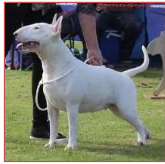
Best Bitch/Puppy - Potens Rainbow Serpent