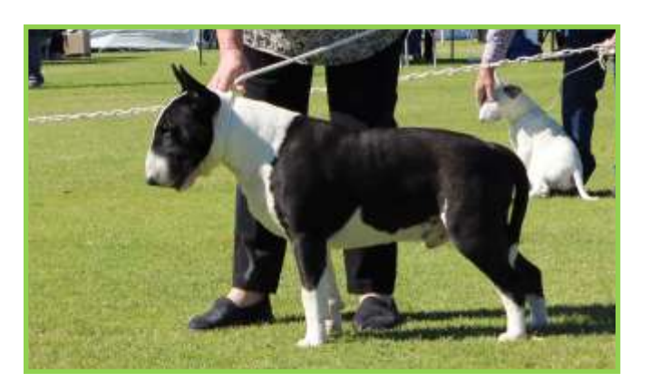
Best Puppy – Sturgis Beyond The Veil