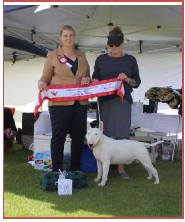
Best In Show/Best Dog/Best Intermediate CH Kaha High Roller (AI)