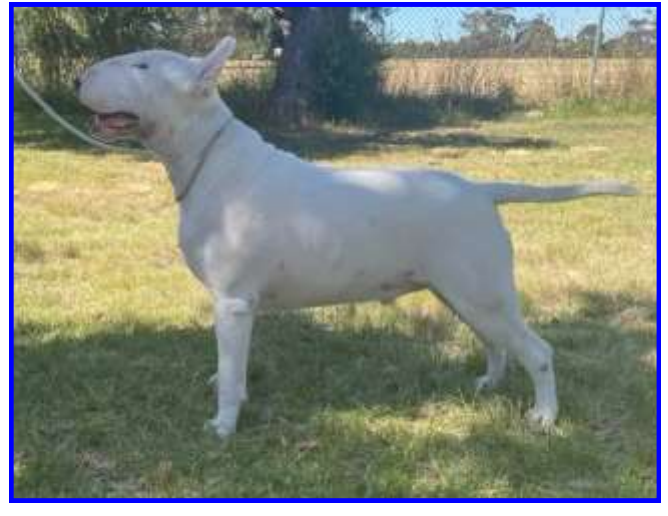
Best In Show/Best Dog/Best Open Potens Dread Fort