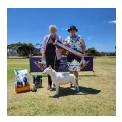
Stardom Merlot Tipped Diamon

A brindle and white dog with good width and lovely proifile of head, would like more finish, good mouth. He has a very good length of neck and good shoulder, he would benefit by more length of upper arm to balance him out, I would like to see more bone throughout. He had a slight roach over his loins and a correct tailset, he could do with more strength and angulation to his stifles. Moved close coming ok behind.