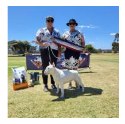
Ch. Kaha High Roller Al