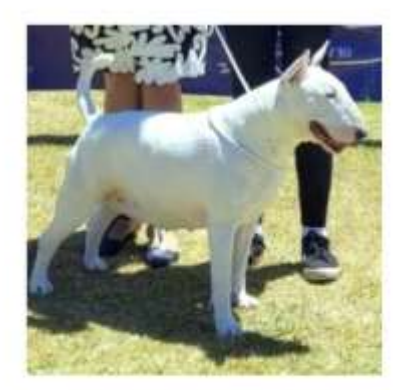
BEST IN SHOW, CHALLENGE BITCH AND BEST AUSTRALIAN BRED IN SHOW