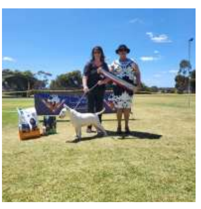
Braxstar Rock N Roll Outlaw