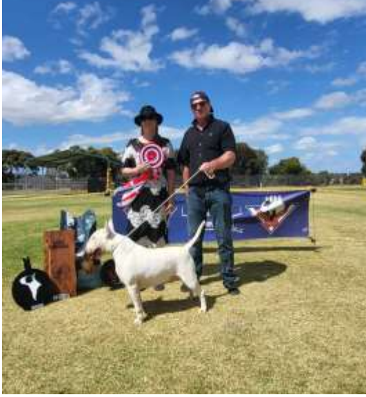
Jacamar Gypsy King