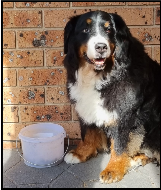
Lola Azzabern 2011