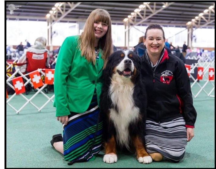
NICHO Ch Branbern Dark By Design 07.10.2013

Nicholas, or more affectionately known as 'Nicho', is a gentle sweet boy and a big softy who loves nothing more than a cuddle on the lounge. Now, at nearly 10 years of age, he lives a well deserved life of luxury - full time 100% house dog!