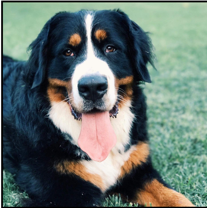
KORA Zollikon Transcending 21.06.15

Kora, my absolute soul dog, is such a special girl. At the age of 34, I have been lucky enough to own 8 dogs since I was 21. Kora is my second Bernese out of a total 5 Bernese. She's unlike any of the others. She's the perfect combination of sweet, grumpy, cheeky, bitchy, loveable, opinionated, noisy, cuddly, noisy, playful, noisy, assertive and oh, have I mentioned noisy yet. She loves everyone she meets and everyone she meets loves her but she's got the most loving eyes for me and I feel the same way about her. She's the best thing I've ever met and I'm so proud to see her reach Veteran age. Such an accomplishment