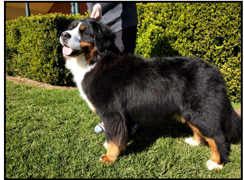
MACEY Ch Branbern Sweet and Sassy 12.04.2015