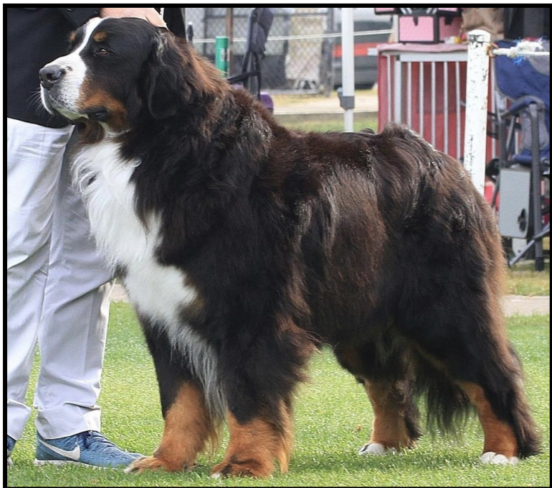
BEAR Branbern Dark Orsetto 08.03.16