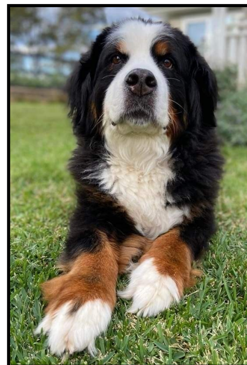
WENDY Neut Ch. Aust Ch Zanzebern Winter Wonderland 09.10.2010

Wendy is the role model perfect dog in our house and extremely easy to live with and comes from very long lived lines as her mum Rosie lived to the great age of 12yrs 9 months and her half sister Kandy lived to 12yrs 10 months. Wendy was the first Bernese to achieve the title of Grand Neuter Champion and we have shared many special times together. Although she is heading towards her 13th birthday she still has a spring in her step and always a smile on her face and can still climb on the leather lounge and we are hoping she will achieve that wonderful milestone of 13.