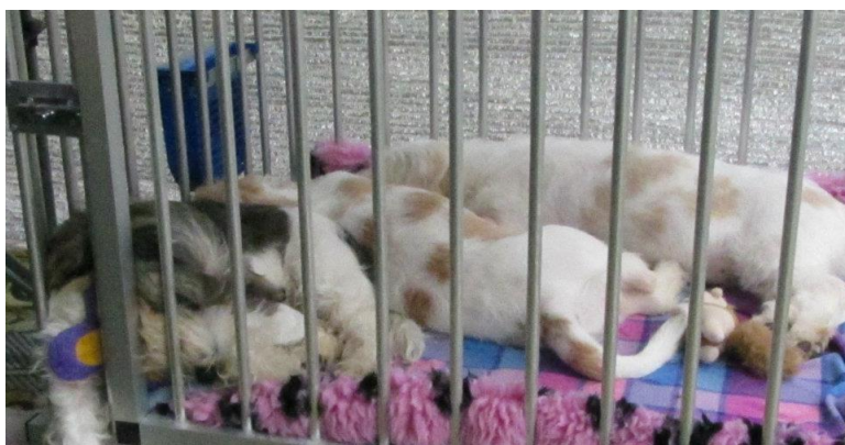
Shows are just so exhausting

The Basset Griffon Vendéen Club www.bgvclub.co.uk