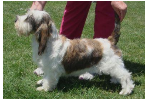
Rokeena Pretty Ballarina

10-Mar-12 Robertson Baby Puppy in Group Agricultural & Horticultural Society Inc