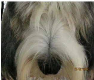
Cover Photo- Edward - Ire Ch/Aust Ch Switherland the Outlaw – up close and personal