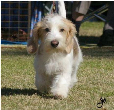
Ch La Folie Very Valentino

14-Jan-12 South Eastern Kennel Club Inc Minor Puppy in Group