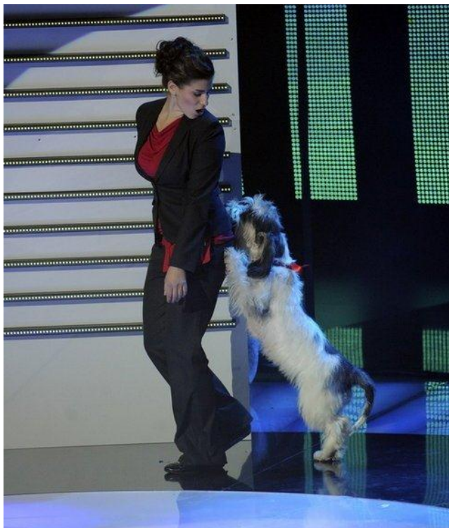
Zoomie the GBGV doing dancing with Dogs in Europe