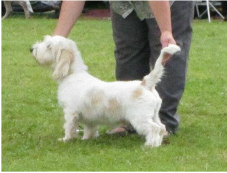
Jimab Mr Briteside