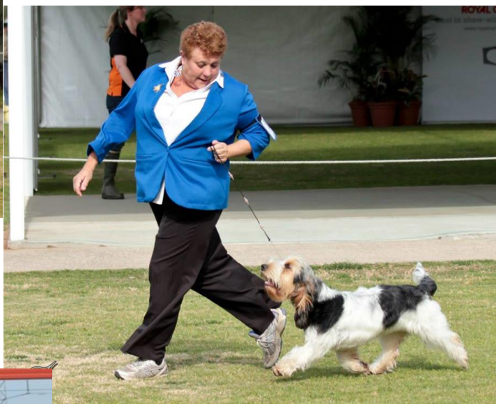
Puppy BCC and BOB – Rickaby Dare to Dream , also for Puppy in Show,