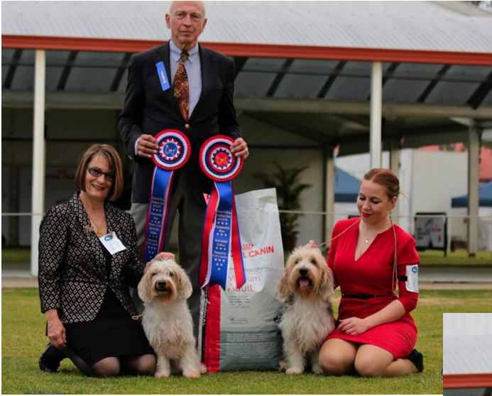
Open in Show was the Runner Up in Show Gr Ch Rokeena Esprit Naturaland Veteran In Show was the Best in Show, Gr Ch Rokeena Jolie Diamant CD..