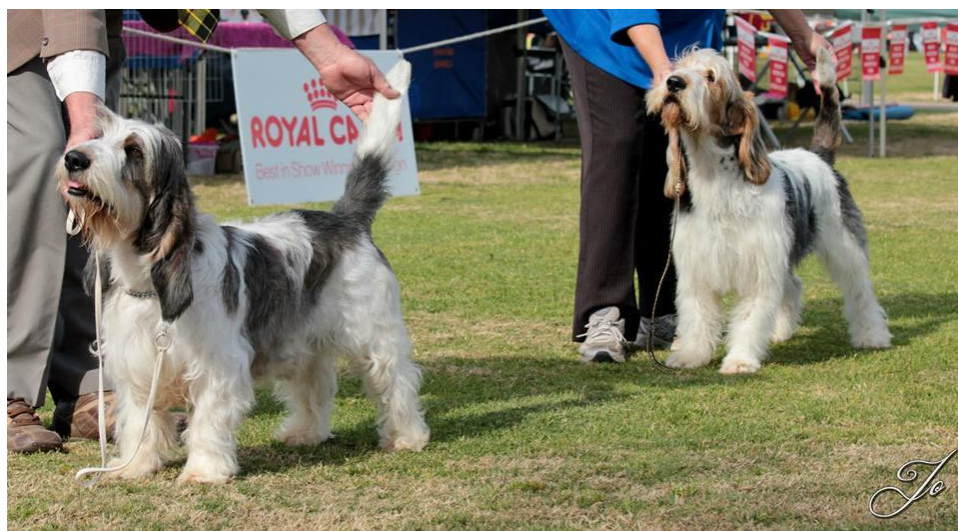
Ch Debucher MiLord & Rickaby Dare To Dream line up for the GBVG BOB