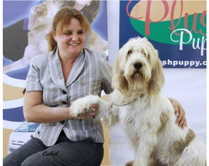
Ch Tarmachan Flocon De Neige (Imp Uk)