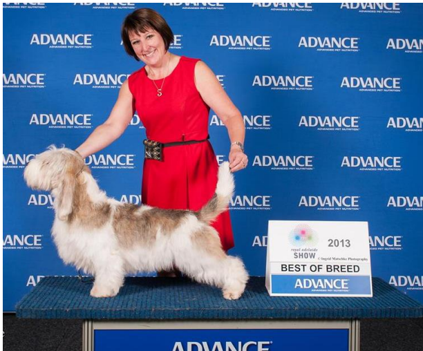
Ch Rokeena Garcon Reveur BOB