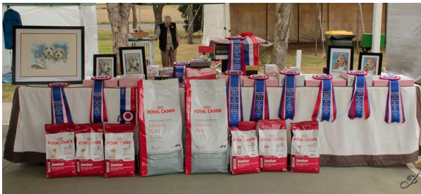
The Trophy Table at the 2013 BGV Club Championship show