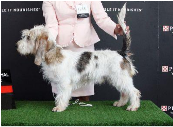
Ch Holmchappell Marceau (Imp Uk)