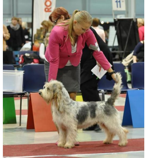
Hocus Pocus van Tum-Tum's Vriendjes

In Petits Soletrader Bjorn Borg was World Winner and Best of Breed and Bubblegum van Tum-