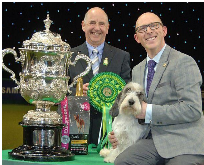
PBGV wins BIS at Crufts 2013