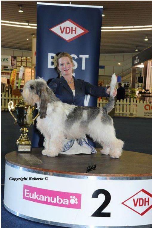
Fido Dido van Tum-Tum's Vriendjes

And the latest news from the World Dog Show held at Budapest 18 th May 2013.