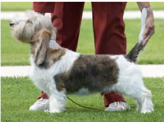
Bondestin Right On The Kisser