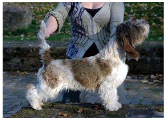
Bubblegum van Tum-Tum's Vriendje