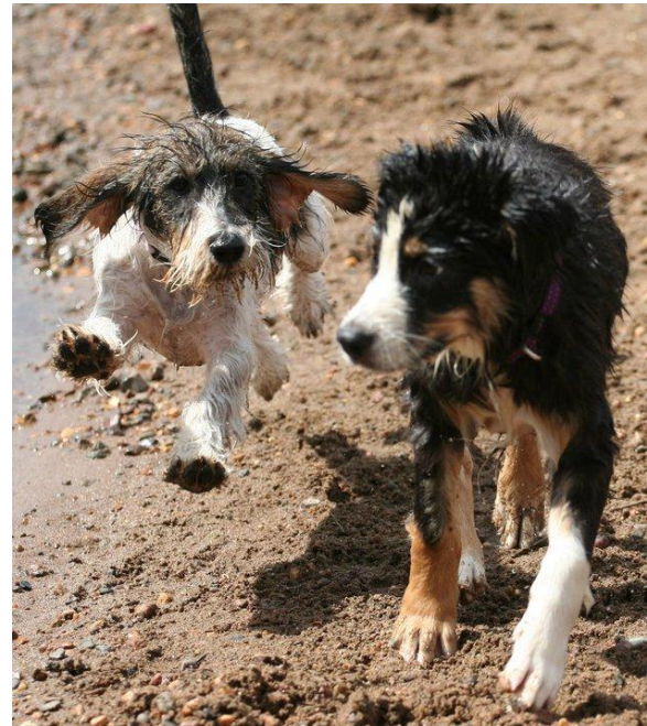
This is more fun that a dog show