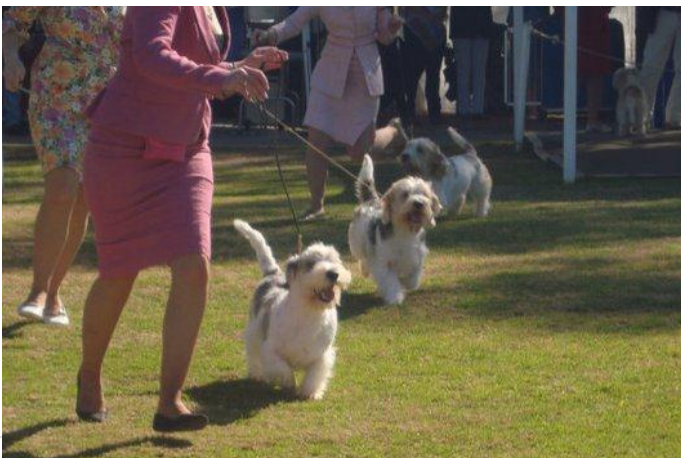
Running to buy a Raffle ticket

The raffle will be drawn at the end of September.