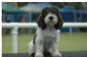
Rokeena Petite Yvette 29-May-11 Bulla Amenities Show Minor Puppy in Group