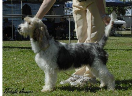
Debucher Waltzer (Imp UK)