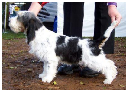
Rokeena the Beez Kneez

26-Jun-11 Wangaratta K & O DC Baby Puppy in Show