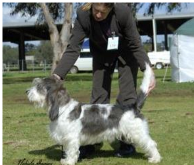
Ch Debucher Milord (Imp UK)

6-May-11 Newcastle & Northern District R/Up in Group