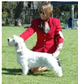
Ch Lafolie Agent Provocateur

8-May-11 Newcastle & Northern Dist KC R/Up in Group