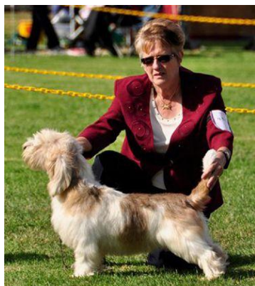
Ch Rokeena Art Nouveau