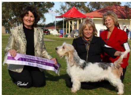
Ch Rokeena Versailles