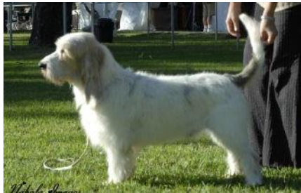
UK Ch Debucher Picobello (Imp UK)

26-Jun-11 Wangaratta K & O DC Baby Puppy in Show