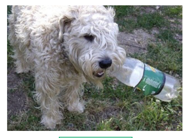
Oh Oh! More evidence?

Now requesting photo contributions for the second edition.