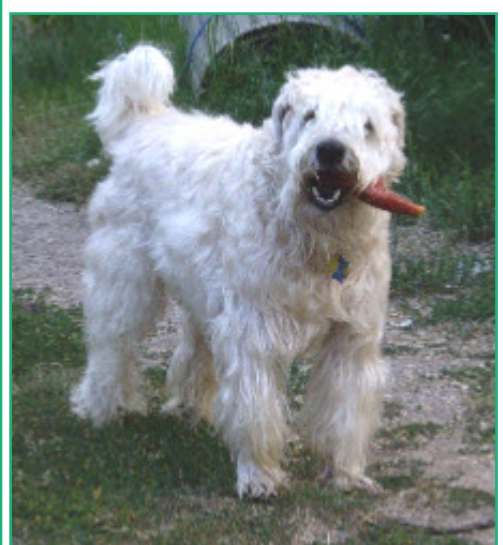
Honestly - does he look like a toy demolisher!

If your Wheaten develops into a heavy-duty toy shredder, it can be difficult to find suitable toys on the market. Of course, large raw bones can provide endless hours of chewing pleasure for your dog, but what are the other options? Here are some that I have had personal experience with as one of my dogs is a toy demolisher!