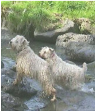
Edition 3: June 2009