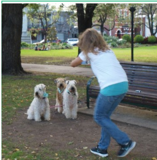
Are we on Camera 1 or 3?