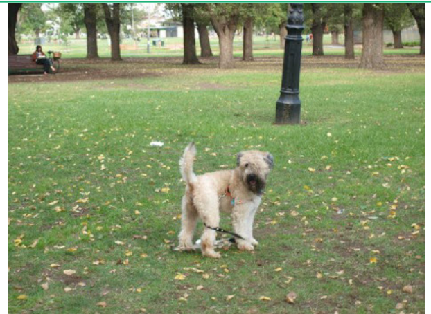
Just to prove it was Autumn

The RSPCA's annual Million Paws Walk was held on Sunday May 20th around Albert Park Lake. A number of wheatens and their owners participated again this year.