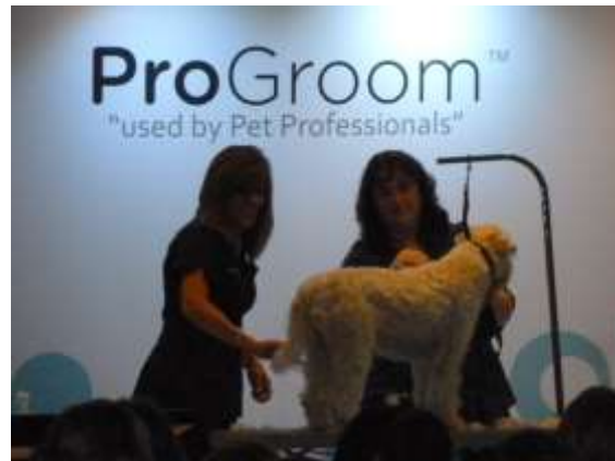
Finnegan undergoing a make-over