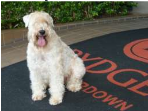
A new look Finnegan