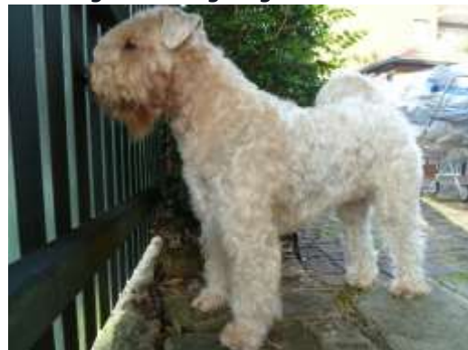
Finnegan looking very smart indeed.

If you come across a good groomer who is gentle with your dog(s), please send me their details So that I can add them to a list of groomers which I will put in a file on the Club website and on the SCWT Downunder FB page.