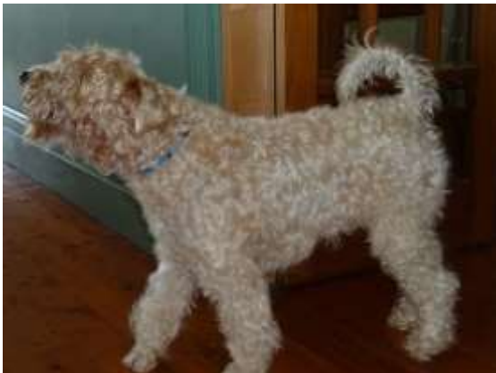
Finnegan on arrival