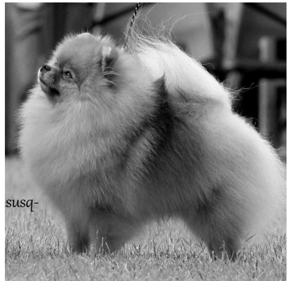
Aust. Ch. Pomquest Don't Ya Wish