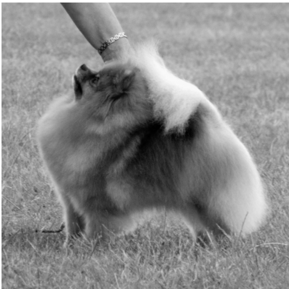
Aust. Ch. Pomquest Dare To Dream

After our debut litter in 2008, we had no litters in 2009 but during 2010 we had 4 litters sired by Merlin and 1 litter sired by his littermate brother Salem. Of these litters 2 of them were using imported bitches that we had previously shown for Ven Grasso (Neadthav Pomeranians).