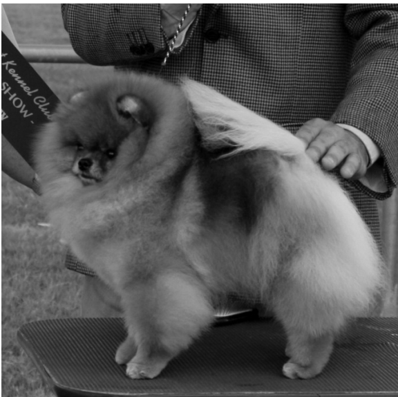
Aust. Supreme Ch. Winterspell Wizard