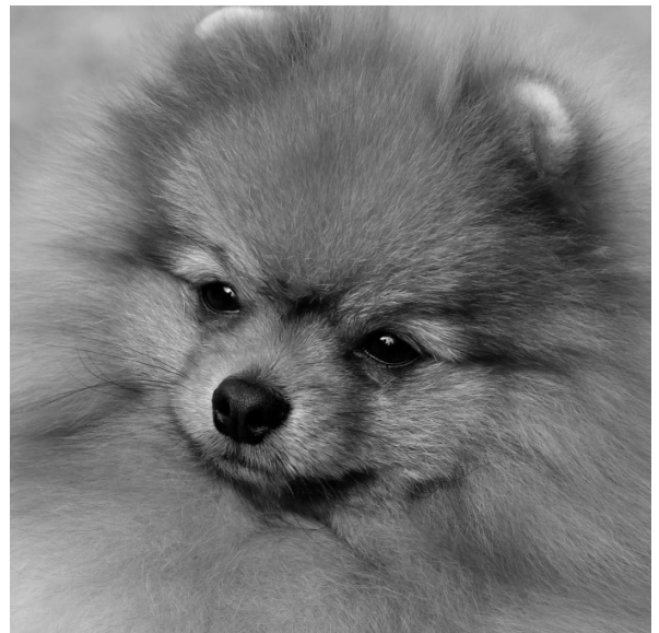
Aust. Ch. Wintersepll Warlock