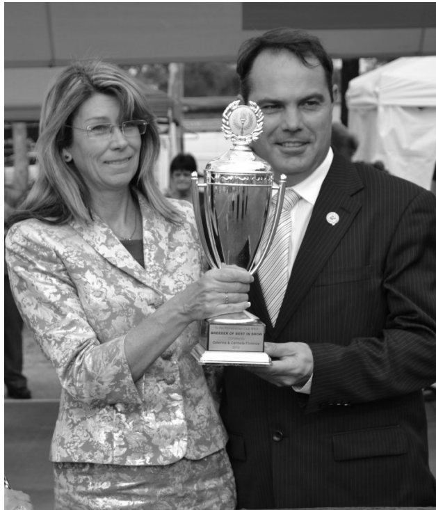
Proud Breeders of BISS at Pomeranian Club of NSW