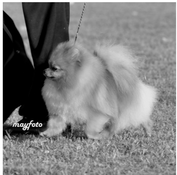
Aust. Ch. Pomquest Keep Livin The Dream

*All rankings listed from Dogzonline National Pointscore.