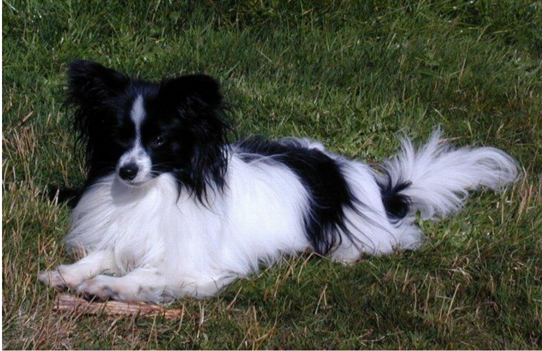
'Jack' - Maisongabbi Diamond Jack