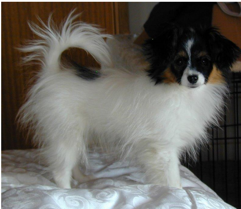
'Jill' – Jirralea Wild Honey at 6 months