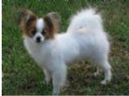
Mondelise Heavenly Bliss