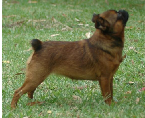
4 th Place – Ch Balliol Dolly Dimple