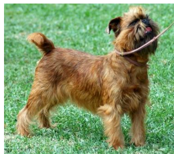
10 th Place – Ch Shigriff Slap n Tickle