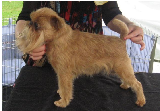
6 th Place – Ch Rosndae Charlie Brown

There were only 3 points separating the 3 winners making an exciting conclusion to our first competition.