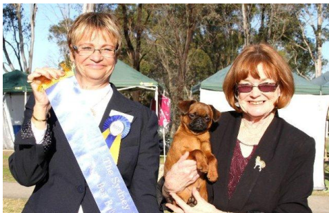
Tiroroa Get Smart (Imp NZ) 30-Jul-11 The Sydney Kennel Club Baby Puppy in Group