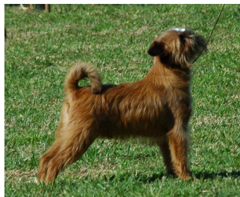
Balliol Gellert Grindalwald