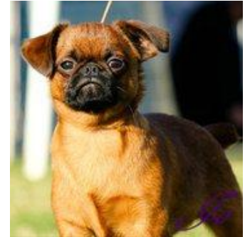
Tiroroa Get Smart (imp NZ)