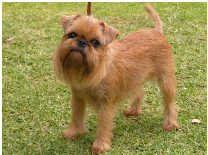
Ch Rosndae Charlies Angel