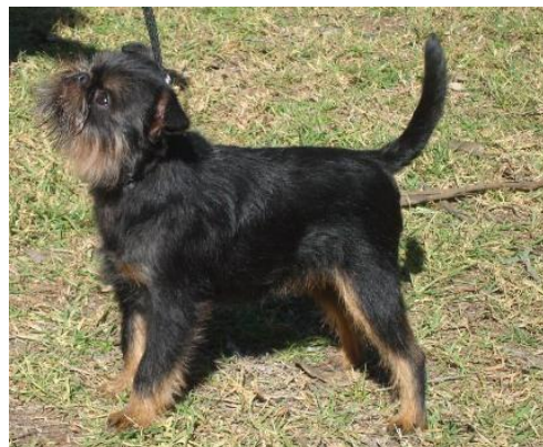
8 th Place – Ch Kehael Million Dollar Man

Many thanks to all the members who supported the point score and we look forward to the next point score which will be even bigger and better.