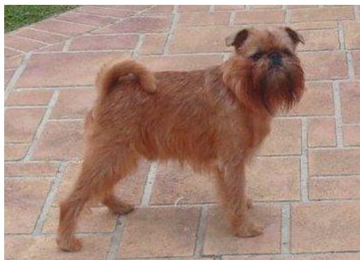
Ch Rosndae Ginger Snap

At the time of writing 3 point score shows have been held. They were North of the Harbour, The Spring Fair and the Lake Macquarie Show held at the Newcastle International Spring Spectacular. All 3 shows had international judges and it was interesting to see the different judging preferences.