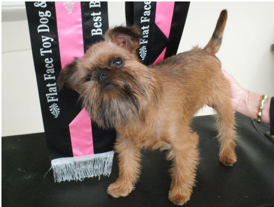
Annie, (Rosndae Naughty but Nice )with her two Baby Puppy in Show ribbons

Baby Puppy in Show Rosndae Naughty but Nice - Finch