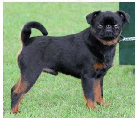
Ch Beauview Brave as a Blizzard