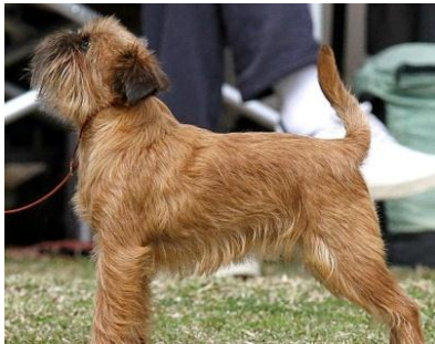
Balliol Gertie Giggles 5-Aug-11 Foster-Tuncurry Kennel Club Minor Puppy in Show

7-Aug-11 Mid North Coast Canine Club Minor Puppy in Group