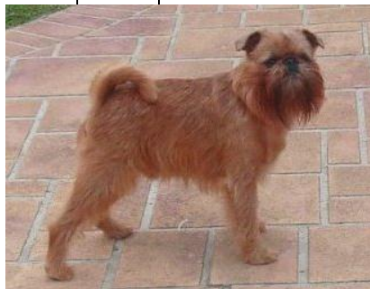
9 th Place – Ch Rosndae Ginger Snap