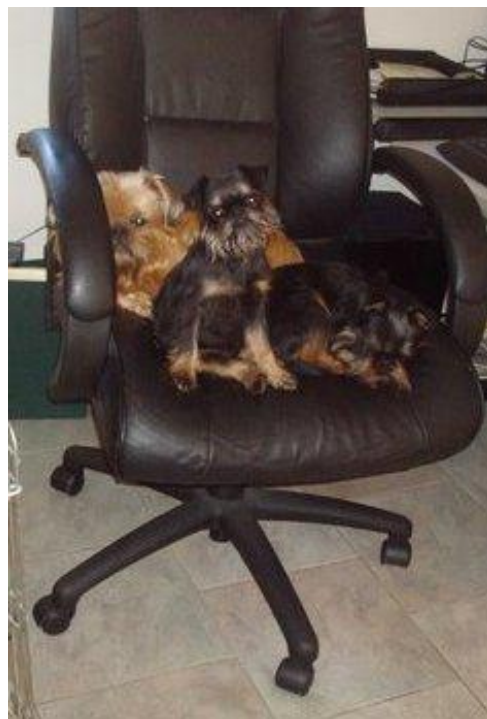
Ready to take the minutes