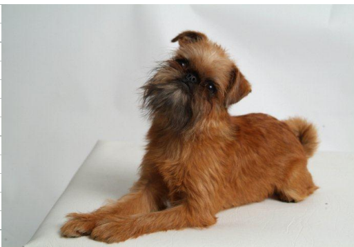
7 th Place – Ch Nagpuni Brooklyn Babe

Many thanks to all the members who supported the point score and we look forward to the next point score which will be even bigger and better.