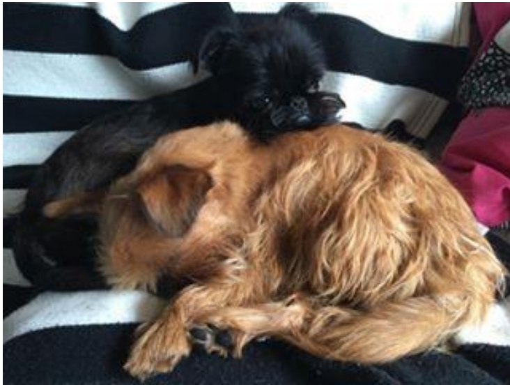
Janet, curled up with Jannelle's big black and white dog, Saxon

As she became stronger she was allowed to play with some of Jannelle's older Griffon girls and then as she continued to improve she was able to play with some of the more active Griffons.