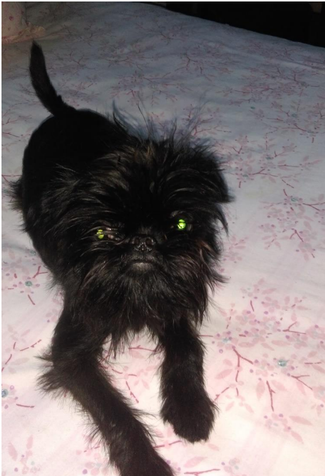
poor breeding and nutrition

However she was a happy little girl and ongoing observation by Jannelle and a full vet check indicated that Osha was otherwise healthy and showed no signs of a neurological condition such as hydrocephalus although the potential for further seizures was still a concern due to the very large size of the open fontanelle.