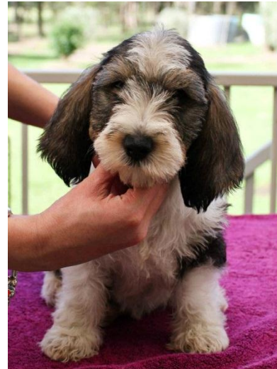
One of the pups from Ed & Miley