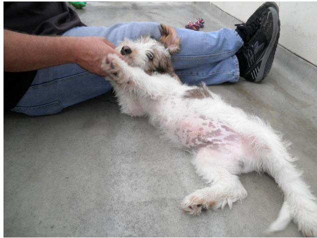
Mack, enjoying the attention while still in quarantine