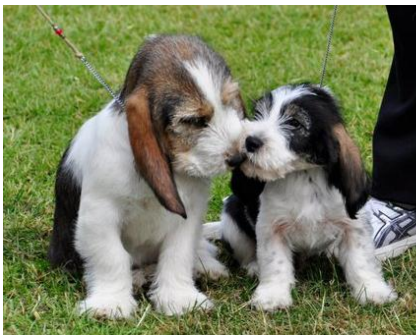
Grand and Petit puppy