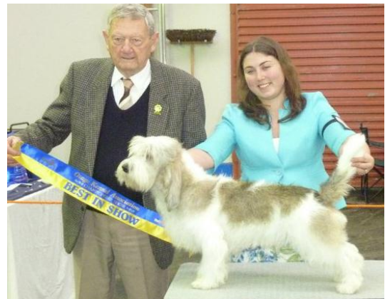
Mr Darcy , NZ Gr Ch Rokeena Garcon Reveur