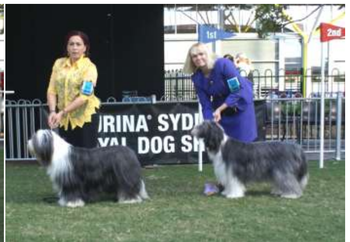
Bitch Ch: Ch Bonibraes Crazy For You HSAs Res CC: Ch Bonibraes Broadway Rhapsody