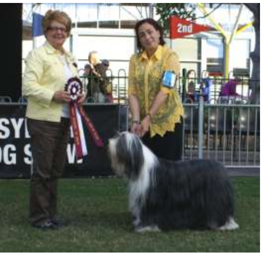
Best In Show & Best Open in Show: Ch Bonibraes Crazy For You HSAs