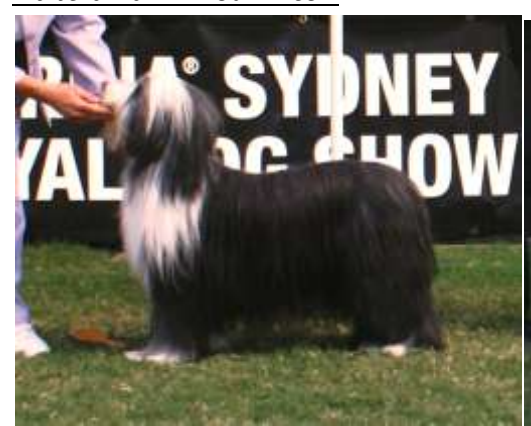
1.Gr Ch Filial Highland Frost K Tasker