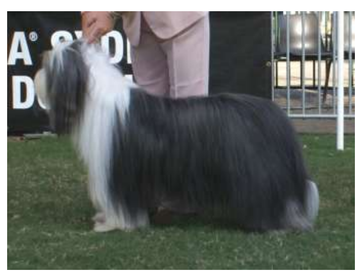
Veteran in Show: Gr Ch Ulara The Luck Dragon