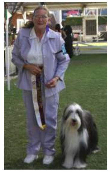
Australian Bred in Show: Gr Ch Filial Highland Frost