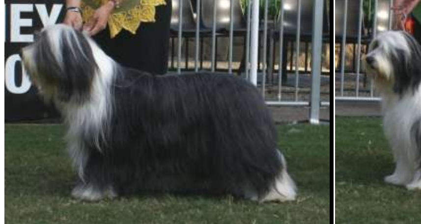
1. Ch Bonibraes Crazy For You HSAs C Macrory & B Insausti