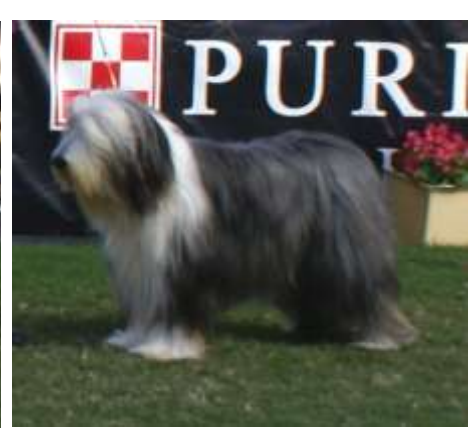
3. Ch Bonibraes Wolfmans Tradition PJ & KJ Finlayson