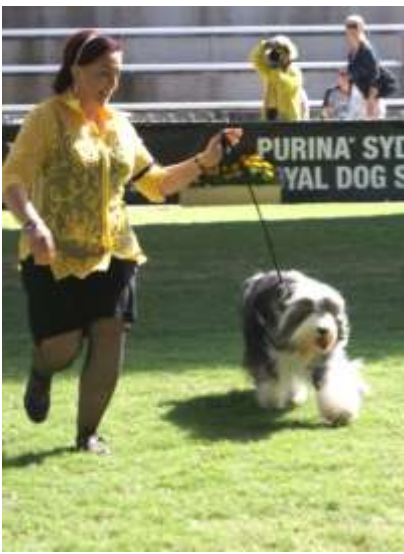
3.Ch Bonibraes Crazy For You HSAs C Mackrory & B Insausti