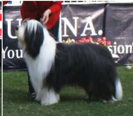
3.Bonibraes Song N Dance PJ & KJ Finlayson and A & A Woolcott