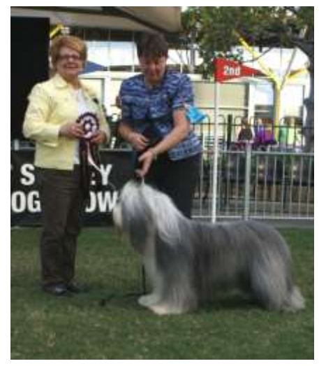
Runner-up in Show: Gr Ch Llandtree Newell Glenn