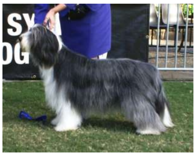
1.Ch Bonibraes Broadway Rhapsody — PJ & KJ Finlayson & W Banks