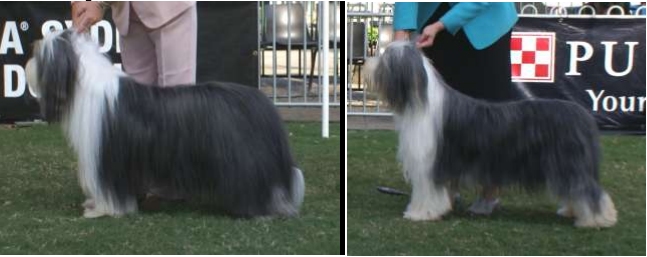
1. Gr Ch Ulara The Luck Dragon HT S Roche