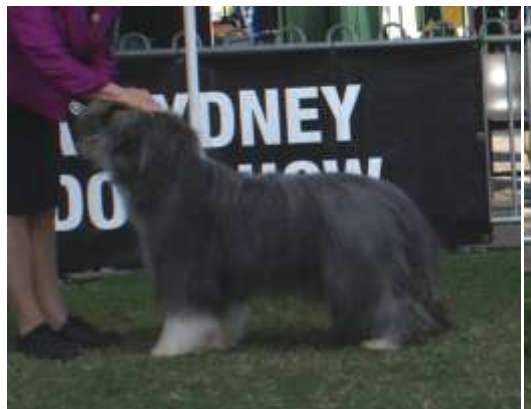
1.Bonibraes Valentino PJ & KJ Finlayson