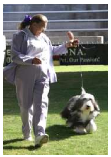
1.Gr Ch Filial Highland Frost -K Tasker