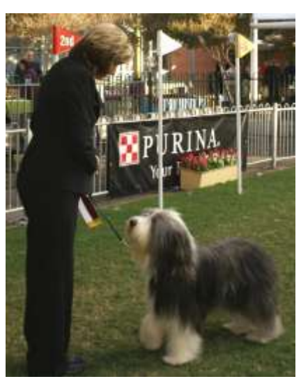
Intermediate in Show: Ch Memorylane It's In His Kiss (Imp Fin)