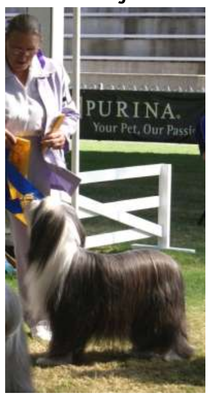
Gr Ch Filial Highland Frost K Tasker