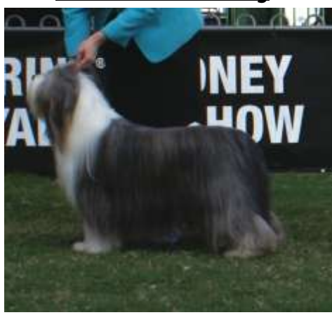
1.Gr Ch Stylwise Paparazzi J Buckley