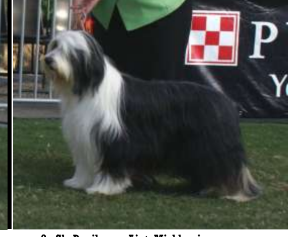
2. Ch Bonibraes Aint Misbhavin PJ & KJ Finlayson