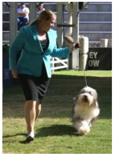
1.Gr Ch Stylwise Paparazzi -J Buckley