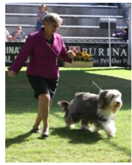
2.Ch Bonibraes Wolfmans Tradition HT-P & K Finlayson