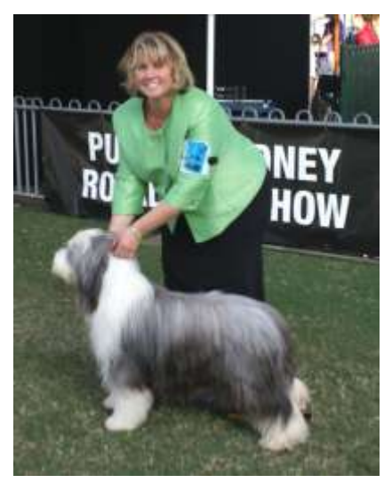
Junior In Show: Ch Bonibraes Dance With Me