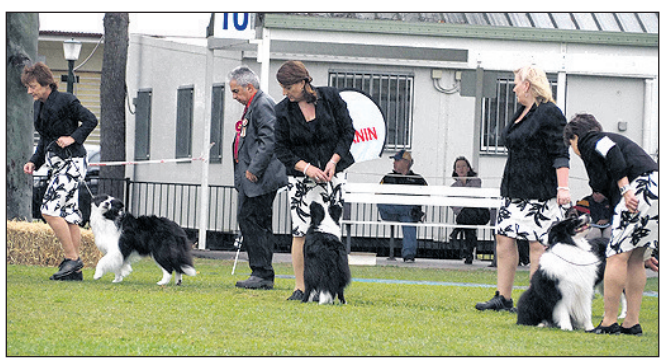
Nahrof Breeder Team in the stakes.