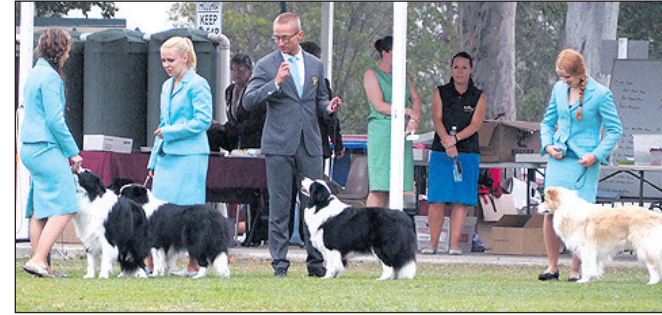
Quinora Breeder Team in the stakes.

On a final note, if you ever get asked to judge at any breed show or at the Brisbane Royal then leap at the chance. The city of Brisbane is exciting, vibrant, clean and safe and with the Sunshine Coast and Gold Coast each less than one-hour drive away to the north and south of the city then you can combine shopping with relaxing. Even better if that invite is for 2018, as the city is hosting the Commonwealth Games that year so if your trip coincides with that then you have got it made!!!