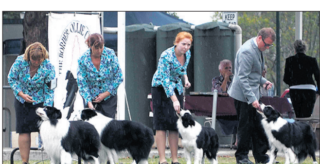
Teyha Breeder Team in the stakes.